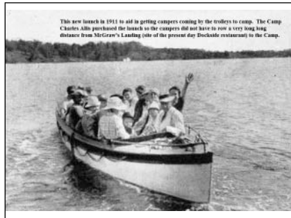
This new launch in 1911 to aid in getting campers coming by the trolleys to camp. The Camp Charles Allis purchased the launch so the campers did not have to row a very long long distance from McGee's Landing (site of the present day Dockside restaurant) to the Camp.

Camp Charles Allis campers at the boat landing area showing the "camp gear" of the day... women with long dresses, men with coats, ties and hats... those were the days! They also had to row those boats to the landings across the lake and then walk a long distance to the stations to board the trolleys to return to Milwaukee. In 1911 the Camp bought a launch and long-distance rowing ended.